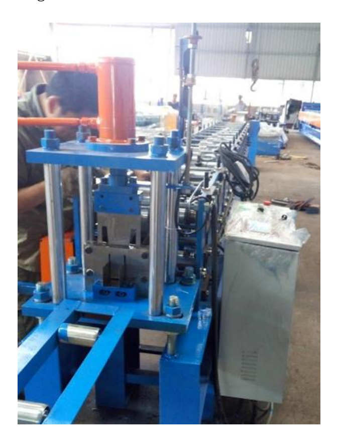
六)、Flat collect rack 3m

Knife material: Cr12, quenching hardness of up to HRC56-58 degrees.