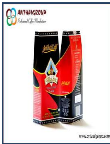
King Weasel 200g