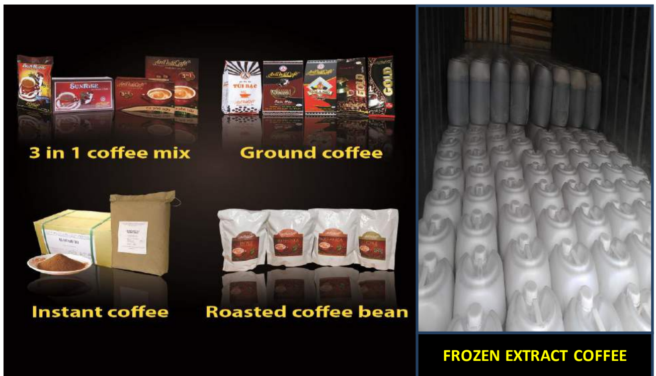
3 in 1 coffee mix