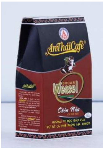
Brown Weasel 200g