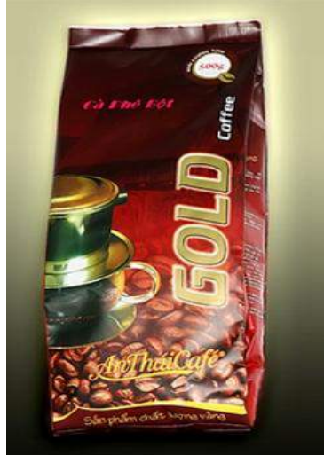
Gold coffee 500g