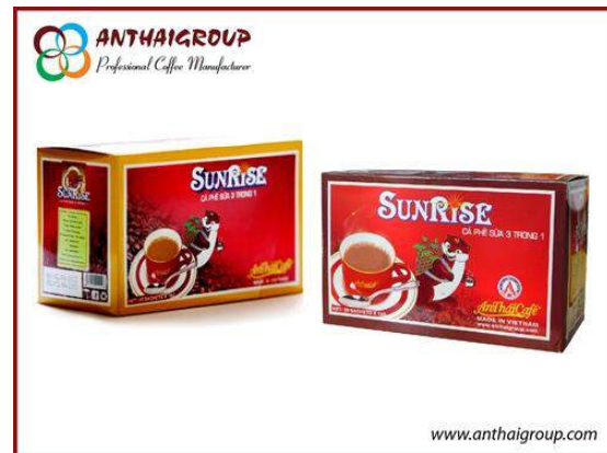
Instant Sunrise coffee