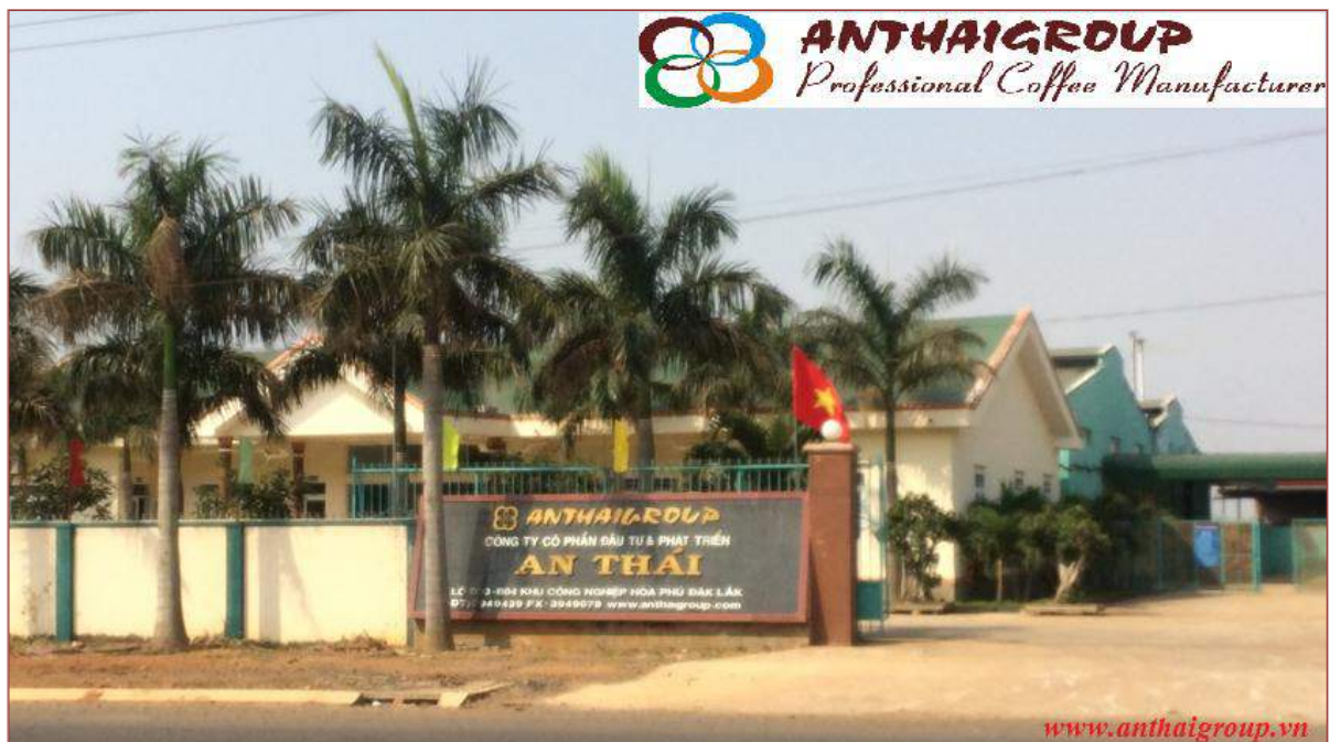
Our factory in Buon Ma Thuot