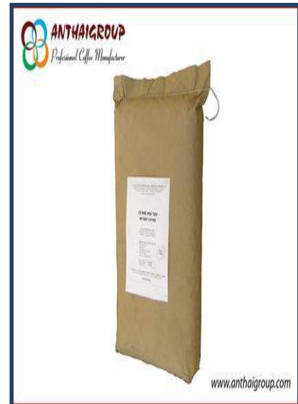
20kgs / bag