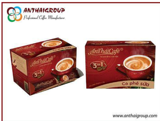
Instant An Thai coffee

We have 2 kinds with difference of percentage of ingredients: An Thai Brand & Sunrise