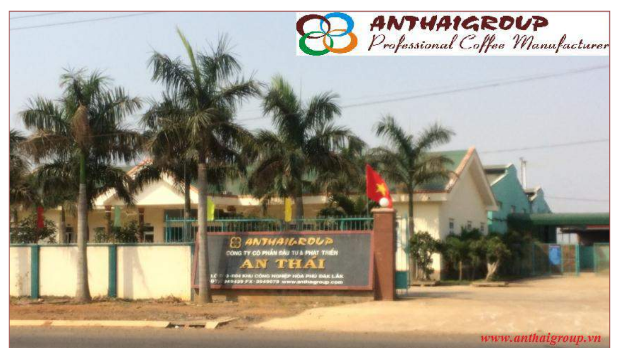
Our factory in Buon Ma Thuot