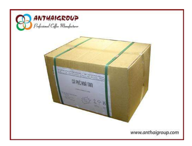
25kgs/carton, 215 cartons (5MT) /container 20'

10kgs/bag, 600 bags (6MT) /container 20'