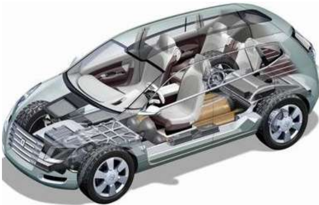
Toy car housing and accessories