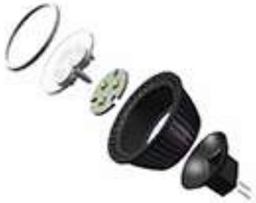
Whole set lamp housing and accessories