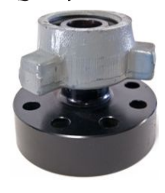
2 1/16" 5,000 PSI x 2" Fig. 1502 Male(Nut Half). API 6A (Shown Above)

Quality Products, at a reasonable cost, delivered on time!