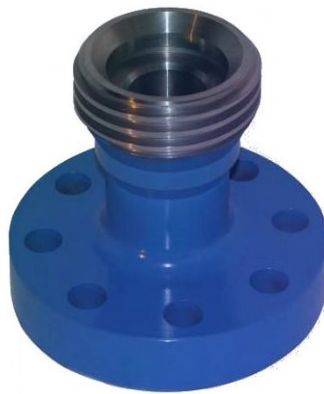
2 1/16" 15,000 PSI x 2" Fig. 1502 Female(Threaded Half). API 6A. (Shown Below)