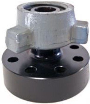
2 1/16" 5,000 PSI x 2" Fig. 1502 Male(Nut Half). API 6A (Shown Above)

Quality Products, at a reasonable cost, delivered on time!