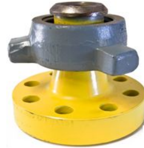
1 13/16" 15,000 PSI x 2" Fig. 1502 Male(Nut Half). API 6A (Shown Above)