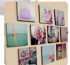
Wood Decorative Painting