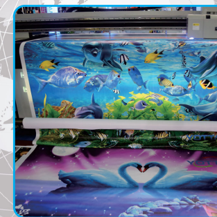
Roll materials printing