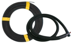
↑ PIGGY WIRE MMO WIRE ANODE

MMO Mesh Ribbon Anode Performance Test from Det Norske Veritas (U.S.A.), Inc. under the standard of NACE TM0294