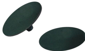
↑ ELLIPTICAL MMO DISK ANODE