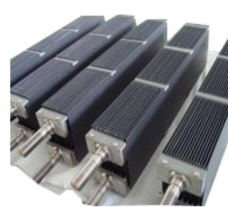
↑ MIXED METAL OXIDE TITANIUM ANODES