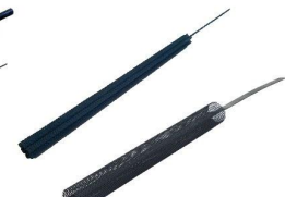
↑ MMO DISCRETE ANODE