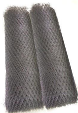
↑ MMO EXPANDED MESH ANODED