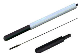
↑ MMO ROD ANODE