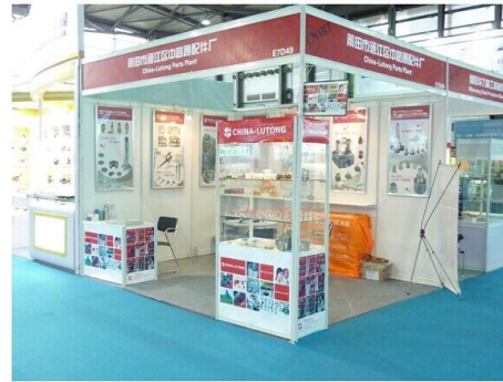
China Canton Fair