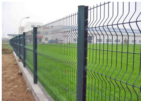
Full Automatic 3D Fence Mesh Production Line JK-FM-2500S&B