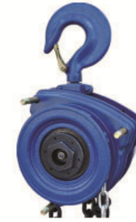
Limit load regulator