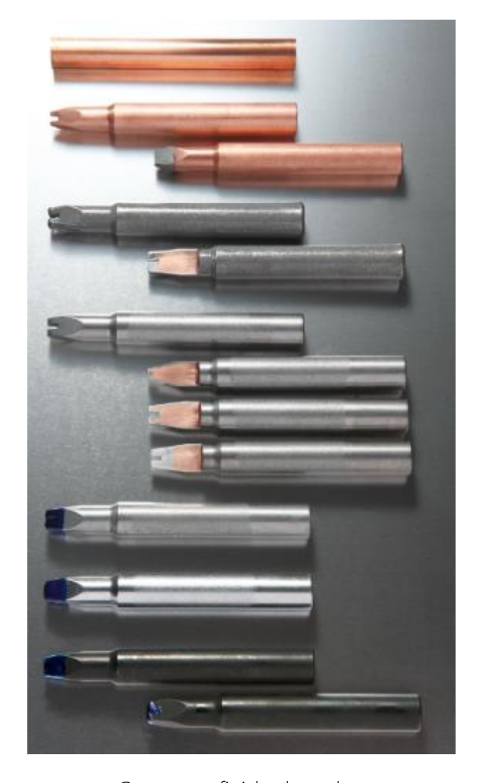
Copper to finished product