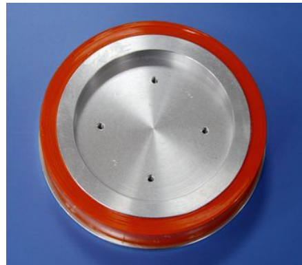
High Precision Side Tropsch Coil