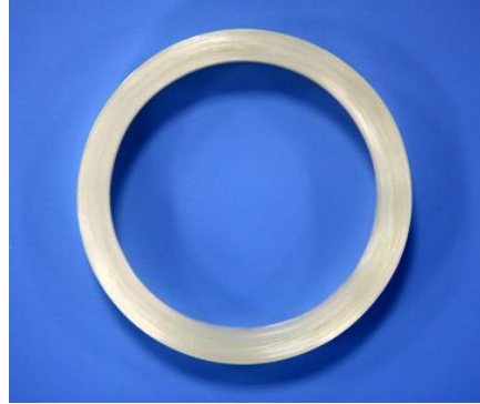
All Off Fiber Optic Coil