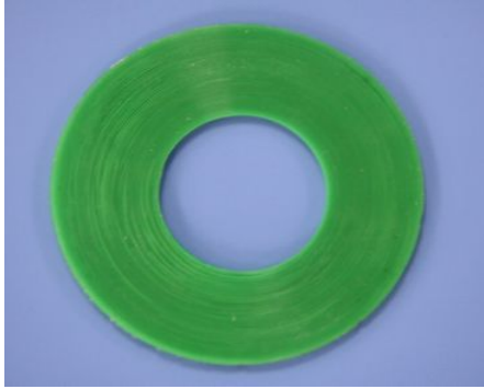
Small Size Without Skeleton Coil