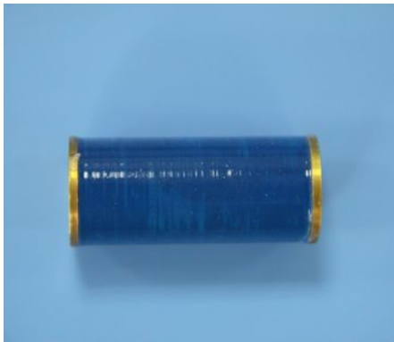
Small Size Cylindrical Coil