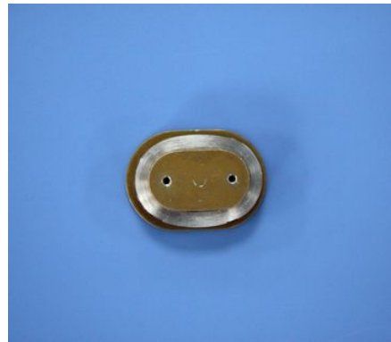
Small Size Oval Coil