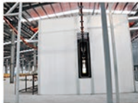
Powder spray booth room