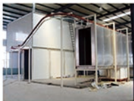
Tunnel curing oven spraying tunnel