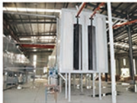
Tunnel curing oven and dry off oven