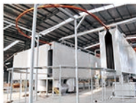
Powder coating line supplied by colo