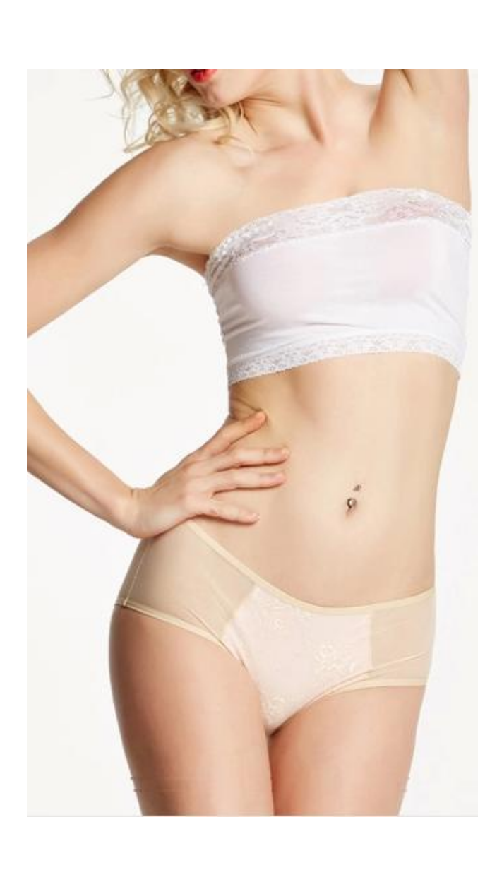
Ystar Underwear Co., Limited