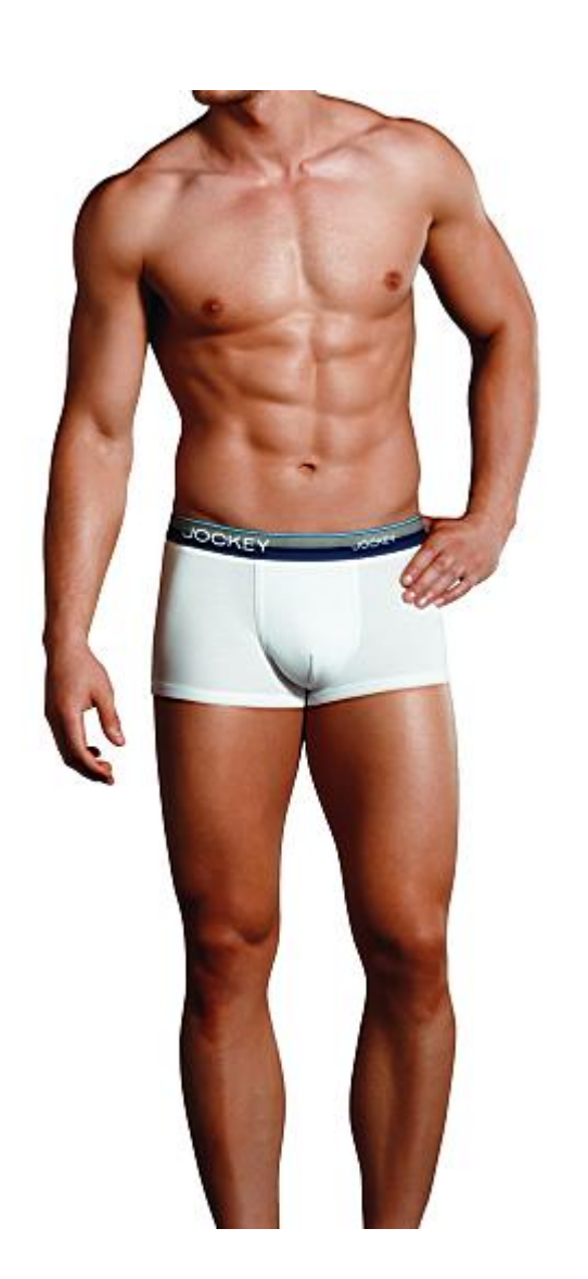
Ystar Underwear Co., Limited