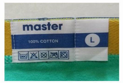
heat transfer print label