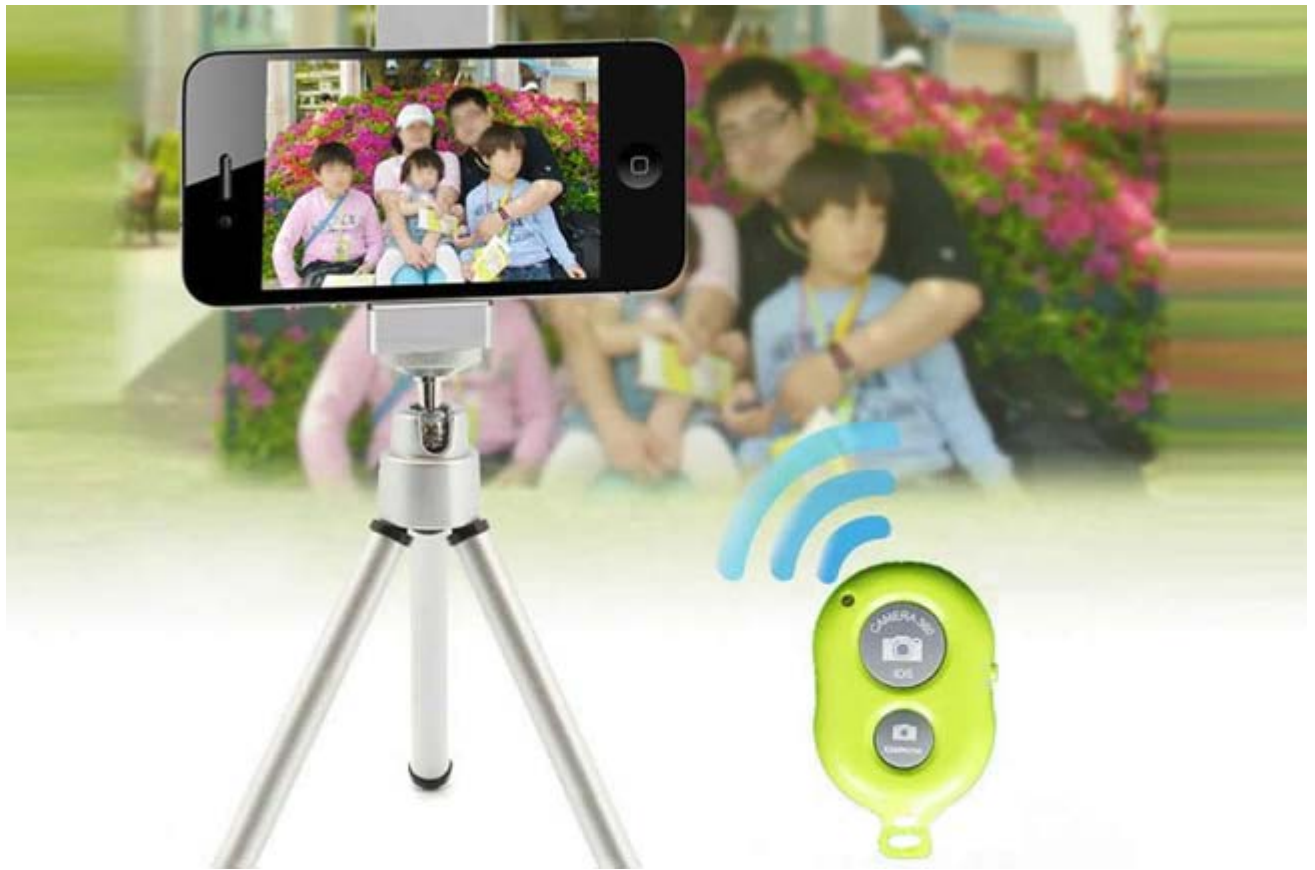
JHM-801 Smart Bluetooth Remote Shutter