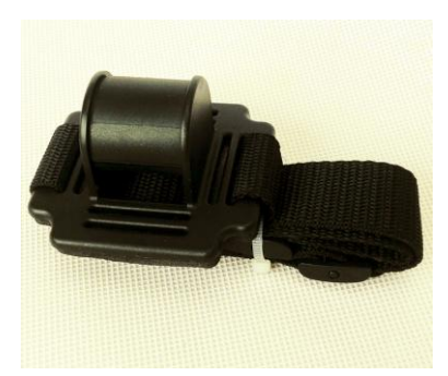
6.Handle bar O ring