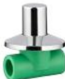
Heavy Stop Valve(C)