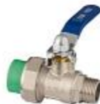
Male Ball Valve With Union