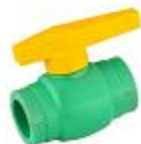
PPR Brass Ball Valve