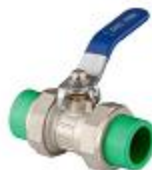
Double Union Ball valve