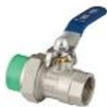
Female Ball Valve With Union