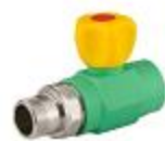
Male Straight Radiator Valves