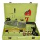
Welding Set Thermostatic-B

Code Specification XHX001 20-32mm XHX002 20-63mm XHX003 75-110mm