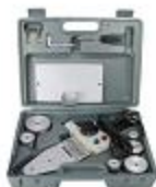
Welding Set Thermostatic-A

Code Specification XHP101 1/2" XHP102 3/4" XHP103 1"