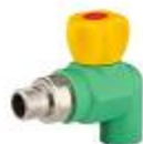
Male Elbow Radiator Valves