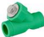
Filter Valve (B)