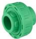
Plastic Adaptor Union