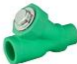
Filter Valve (A)