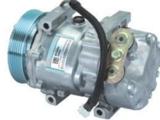
7V16 PICASSO 适用车型/Car Model: 毕加索 带轮槽数/No. of Grooves: 6PK 额定电压/Rated Voltage: 12V 制冷剂/Refrigerant: R134a