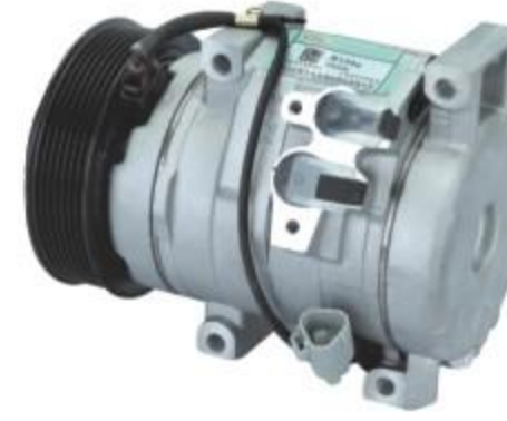
10S17C PREVIA 适用车型/Car Model: 新款大霸王 带轮槽数/No. of Grooves: 7PK 额定电压/Rated Voltage: 12V 制冷剂/Refrigerant: R134a