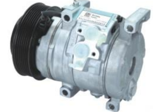
10S15C TOYOTA RAV4 适用车型/Car Model: 丰田RAV4 带轮槽数/No. of Grooves: 7PK 额定电压/Rated Voltage: 12V 制冷剂/Refrigerant: R134a