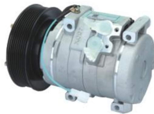
10S17C CAT330C 适用车型/Car Model: 卡特CAT330C 带轮槽数/No. of Grooves: 24V 额定电压/Rated Voltage: 24V 制冷剂/Refrigerant: R134a