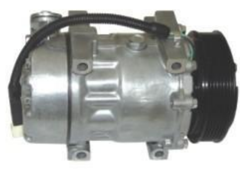
7V16 PICASSO 2.0 适用车型/Car Model: 毕加索2.0 带轮槽数/No. of Grooves: 6PK 额定电压/Rated Voltage: 12V 制冷剂/Refrigerant: R134a