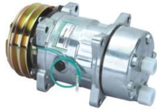
508 JETTA 适用车型/Car Model: 捷达 带轮槽数/No. of Grooves: AO 额定电压/Rated Voltage: 12V 制冷剂/Refrigerant: R12