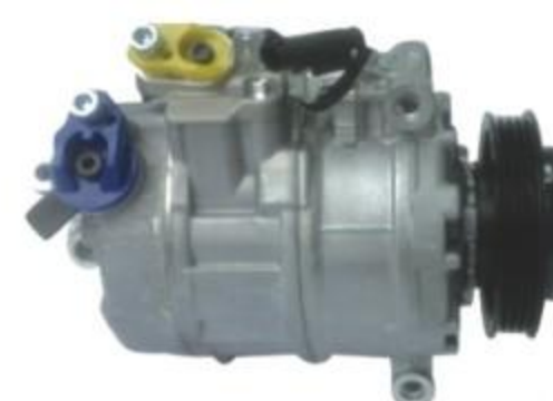
7SEU17C BMW 5S 适用车型/Car Model: 宝马5S 带轮槽数/No. of Grooves: 4PK 额定电压/Rated Voltage: 制冷剂/Refrigerant: R134a