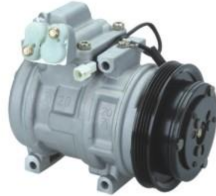
10PA20C DULING WEI 适用车型/Car Model: 都灵威 带轮槽数/No. of Grooves: 4PK 额定电压/Rated Voltage: 12V 制冷剂/Refrigerant: R134a