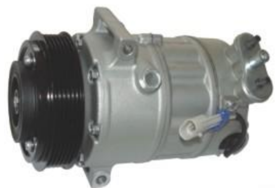
7SEU17C BUICK REGAL (Electronic Control) 适用车型/Car Model: 别克君威 (电控) 带轮槽数/No. of Grooves: 6PK 额定电压/Rated Voltage: 12V/24V 制冷剂/Refrigerant: R134a