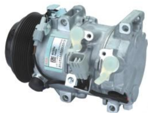
6SEU16C TOYOTA CROWN 2.5 适用车型/Car Model: 丰田皇冠2.5 带轮槽数/No. of Grooves: 7PK 额定电压/Rated Voltage: 12V 制冷剂/Refrigerant: R134a