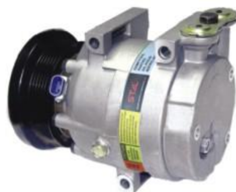
V5 BUICK REGAL GL8 适用车型/Car Model: 别克君威 GL8 带轮槽数/No. of Grooves: 6PK 额定电压/Rated Voltage: 12V 制冷剂/Refrigerant: R134a