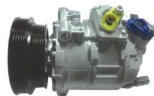
7SEU17C TOURAN 适用车型/Car Model: 途安柴油车 带轮槽数/No. of Grooves: 5PK+5PK 额定电压/Rated Voltage: 制冷剂/Refrigerant: R134a