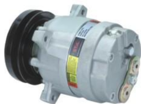
V5 DAEWOO 55 适用车型/Car Model: 大宇55 带轮槽数/No. of Grooves: 1A 额定电压/Rated Voltage: 12V/24V 制冷剂/Refrigerant: R134a