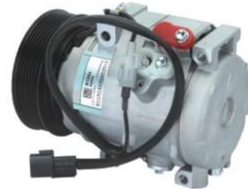
10S17C PAJERO V73 适用车型/Car Model: 帕杰罗V73 带轮槽数/No. of Grooves: 7PK 额定电压/Rated Voltage: 12V 制冷剂/Refrigerant: R134a