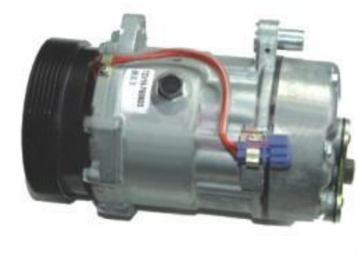
7V16 JETTA 适用车型/Car Model: 捷达王 带轮槽数/No. of Grooves: 6PK 额定电压/Rated Voltage: 12V 制冷剂/Refrigerant: R134a