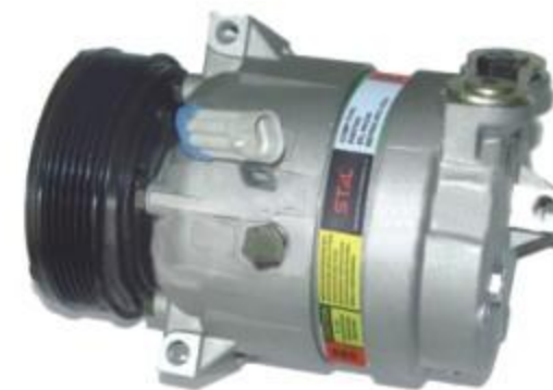
V5 BUICK REGAL 2.0 适用车型/Car Model: 别克君威 2.0 带轮槽数/No. of Grooves: 6PK 额定电压/Rated Voltage: 12V 制冷剂/Refrigerant: R134a