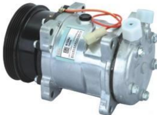
5H14 SANTANA 适用车型/Car Model: 时代超人 带轮槽数/No. of Grooves: 4PK 额定电压/Rated Voltage: 12V 制冷剂/Refrigerant: R134a