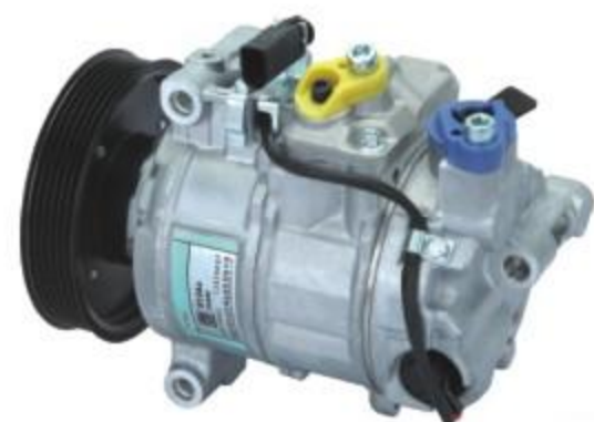
6SEU14C AUDI A4 2.4 适用车型/Car Model: 奥迪A4 2.4 三田品号/Santian No.: ST690304 带轮槽数/No. of Grooves: 6PK 额定电压/Rated Voltage: 制冷剂/Refrigerant: R134a