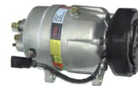
V5 VW V5 BORA 适用车型/Car Model: V5宝莱 带轮槽数/No. of Grooves: 6PK 额定电压/Rated Voltage: 12V 制冷剂/Refrigerant: R134a