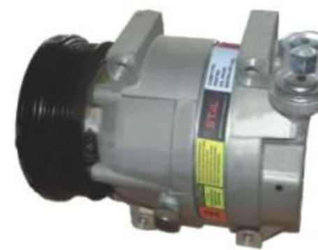
V5 BUICK EXCELLE 1.6 适用车型/Car Model: 凯越1.6 带轮槽数/No. of Grooves: 6PK 额定电压/Rated Voltage: 12V 制冷剂/Refrigerant: R134a