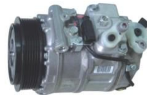
7SEU17C BENZ 适用车型/Car Model: 奔驰 带轮槽数/No. of Grooves: 6PK/110 额定电压/Rated Voltage: 制冷剂/Refrigerant: R134a