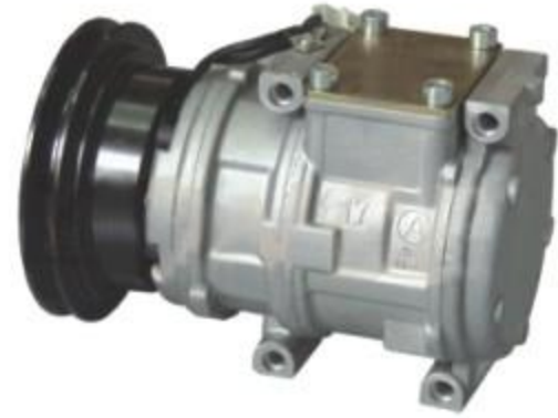
10PA17C 适用车型/Car Model: 外贸 带轮槽数/No. of Grooves: 1A 额定电压/Rated Voltage: 12V 制冷剂/Refrigerant: R134a