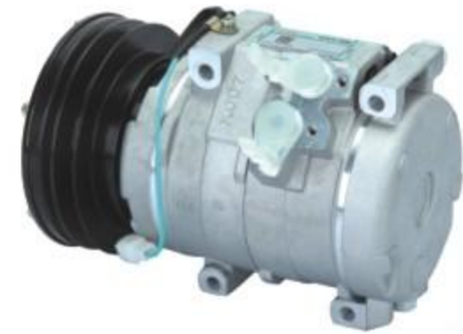
10S17C CAT 320C 适用车型/Car Model: 卡特CAT320C 带轮槽数/No. of Grooves: AO 额定电压/Rated Voltage: 24V 制冷剂/Refrigerant: R134a