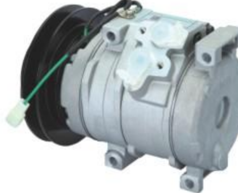
10S15C ISUZU TRUCK MIXER 适用车型/Car Model: 五十铃搅拌车 带轮槽数/No. of Grooves: 1B 额定电压/Rated Voltage: 24V 制冷剂/Refrigerant: R134a