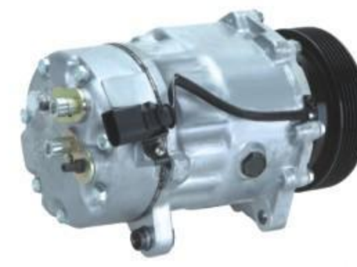
7V16 BORA 适用车型/Car Model: 宝来 带轮槽数/No. of Grooves: 6PK 额定电压/Rated Voltage: 12V 制冷剂/Refrigerant: R134a