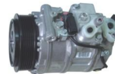
7SEU17C BENZ 适用车型/Car Model: 奔驰 带轮槽数/No. of Grooves: 6PK/100 额定电压/Rated Voltage: 制冷剂/Refrigerant: R134a