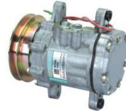
7B10 WULING SUNSHINE/PSNEILK 适用车型/Car Model: 五菱之光 带轮槽数/No. of Grooves: 1A 额定电压/Rated Voltage: 12V 制冷剂/Refrigerant: R134a