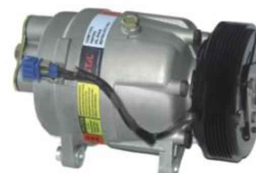
V5 VW V5 JETTA 适用车型/Car Model: V5捷达王 带轮槽数/No. of Grooves: 6PK 额定电压/Rated Voltage: 12V 制冷剂/Refrigerant: R134a