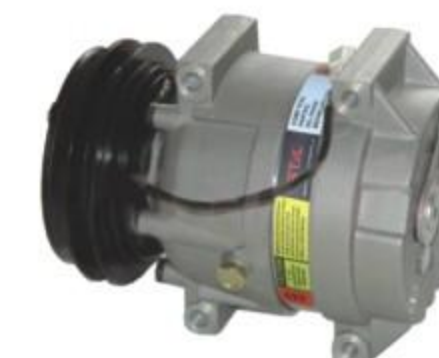
V5 ESPERO/NEXIA 适用车型/Car Model: 大宇 带轮槽数/No. of Grooves: A1 额定电压/Rated Voltage: 12V 制冷剂/Refrigerant: R134a