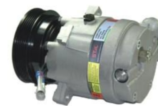
V5 CHEVROLET SAIL 适用车型/Car Model: 赛欧 带轮槽数/No. of Grooves: 6PK 额定电压/Rated Voltage: 12V 制冷剂/Refrigerant: R134a