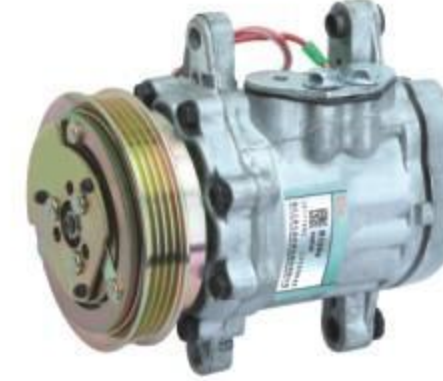
7B10 WULING SUNSHINE/PSNEILK 适用车型/Car Model: 五菱之光五菱荣光 带轮槽数/No. of Grooves: 4PK 额定电压/Rated Voltage: 12V 制冷剂/Refrigerant: R134a