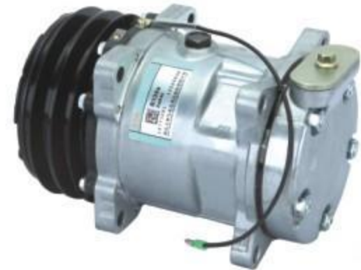
5H14 JMC 适用车型/Car Model: 江铃 带轮槽数/No. of Grooves: 2A 额定电压/Rated Voltage: 12V 制冷剂/Refrigerant: R134a