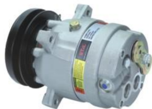
V5 HYUNDAI 55 适用车型/Car Model: 现代55 带轮槽数/No. of Grooves: 1A 额定电压/Rated Voltage: 12V/24V 制冷剂/Refrigerant: R134a