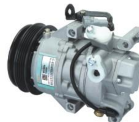
5SEU09C YARIS 适用车型/Car Model: 雅力士 带轮槽数/No. of Grooves: 4PK 额定电压/Rated Voltage: 制冷剂/Refrigerant: R134a