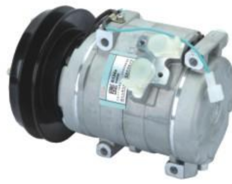
10S15C KOMASTU 200-7 适用车型/Car Model: 小松PC200-7 带轮槽数/No. of Grooves: 1B 额定电压/Rated Voltage: 24V 制冷剂/Refrigerant: R134a