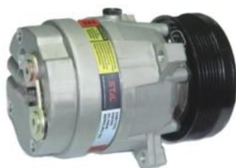
V5 BUICK 3.1 适用车型/Car Model: 别克 3.1 带轮槽数/No. of Grooves: 6PK 额定电压/Rated Voltage: 12V 制冷剂/Refrigerant: R134a