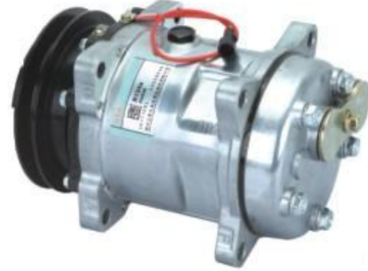
5H14 QING LIN 适用车型/Car Model: 庆铃 带轮槽数/No. of Grooves: 6PK 额定电压/Rated Voltage: 12V 制冷剂/Refrigerant: R134a