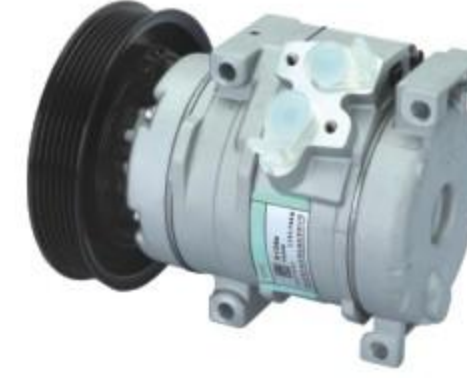
10S15C TOYOTA COROLLA 适用车型/Car Model: 丰田花冠 带轮槽数/No. of Grooves: 6PK 额定电压/Rated Voltage: 12V 制冷剂/Refrigerant: R134a