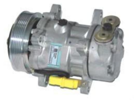
6V12 PEUGEOT 206 适用车型/Car Model: 老标致206 带轮槽数/No. of Grooves: 6PK 额定电压/Rated Voltage: 12V 制冷剂/Refrigerant: R134a