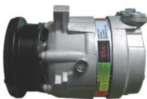
V5 BUICK EXCELLE 1.8 适用车型/Car Model: 凯越1.8 带轮槽数/No. of Grooves: 6PK 额定电压/Rated Voltage: 12V 制冷剂/Refrigerant: R134a