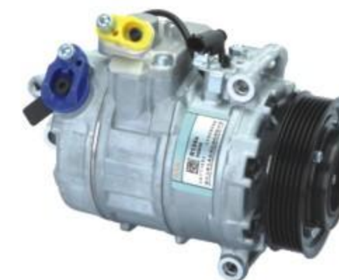
7SEU17C BMW 7S 适用车型/Car Model: 宝马7S 带轮槽数/No. of Grooves: 6PK 额定电压/Rated Voltage: 制冷剂/Refrigerant: R134a