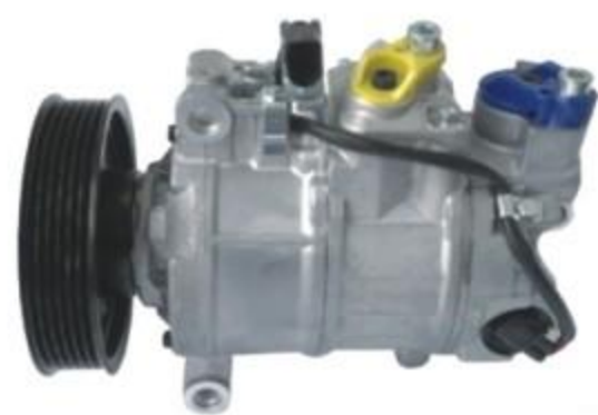
6SEU14C AUDI A4 3.0 适用车型/Car Model: 奥迪A4 3.0 三田品号/Santian No.: ST690305 带轮槽数/No. of Grooves: 6PK 额定电压/Rated Voltage: 制冷剂/Refrigerant: R134a