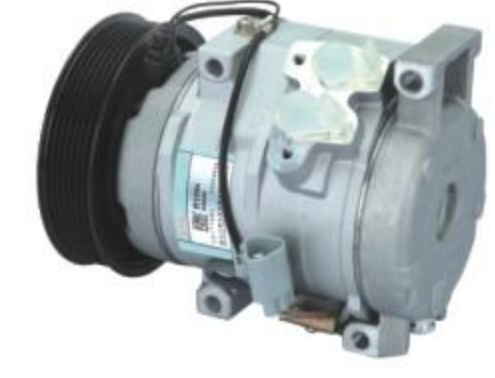
10S17C TOYOTA CAMRY 2.4 适用车型/Car Model: 丰田佳美2.4 带轮槽数/No. of Grooves: 7PK 额定电压/Rated Voltage: 12V 制冷剂/Refrigerant: R134a