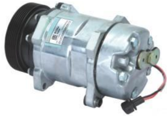
5H14 JETTA GT 适用车型/Car Model: 捷达王 带轮槽数/No. of Grooves: 6PK 额定电压/Rated Voltage: 12V 制冷剂/Refrigerant: R134a