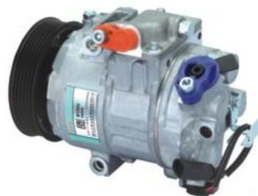
6SEU14C VW POLO 适用车型/Car Model: 大众波罗 带轮槽数/No. of Grooves: 6PK 额定电压/Rated Voltage: 制冷剂/Refrigerant: R134a