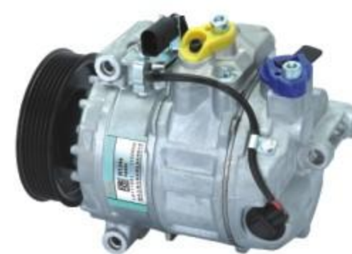
7SEU17C VW PHAETON/TOUAREG 适用车型/Car Model: 大众辉腾 途锐 带轮槽数/No. of Grooves: 6PK 额定电压/Rated Voltage: 制冷剂/Refrigerant: R134a