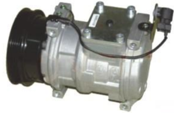
10PA17C 适用车型/Car Model: 外贸 带轮槽数/No. of Grooves: 4PK 额定电压/Rated Voltage: 12V 制冷剂/Refrigerant: R134a