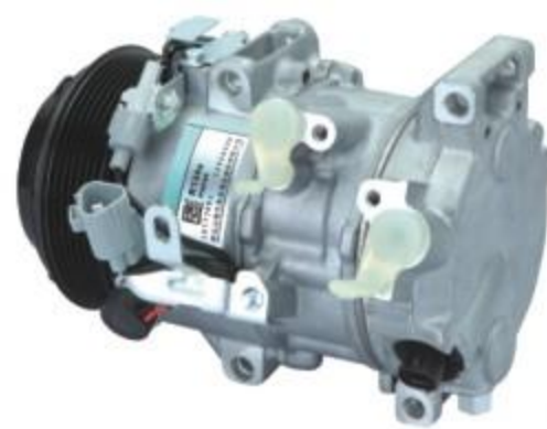
6SEU16C TOYOTA CROWN 3.0 适用车型/Car Model: 丰田皇冠3.0 带轮槽数/No. of Grooves: 7PK 额定电压/Rated Voltage: 12V 制冷剂/Refrigerant: R134a