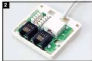
cover the dust caps of the jack carefully.