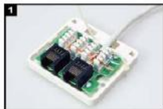
The back of the Couplers.