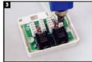
Terminate the wires using Linkbasic's tools (TLA01) or equivalent.