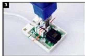
Terminate the wires using Linkbasic's tools ( TLA01 ) or equivalent.