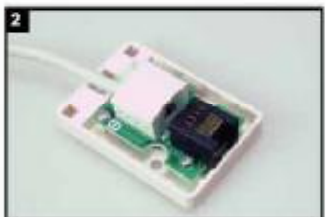
cover the duct caps of the jack carefully .