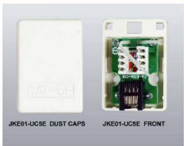
JKE01-UC5E DUST CAPS