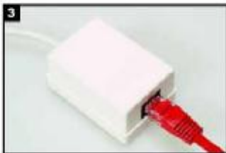
coupler assembly .