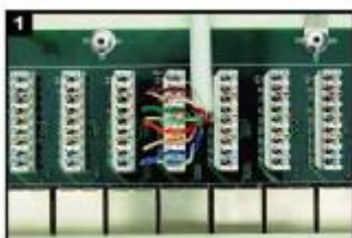
1 Insert each wire into the appropriate channel.