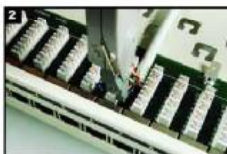
2 Terminate wires using Linkbasic tool (P/N: TLA01) or equivalent.