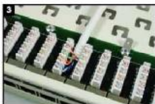
3 Check and ensure each wire in correct slot.