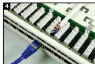
4 Insert the jack into the correct mounting location properly.