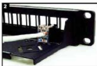
Position the keystone jack for installation.