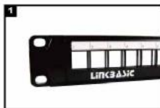
The bracket of Cat 5E patch panel.