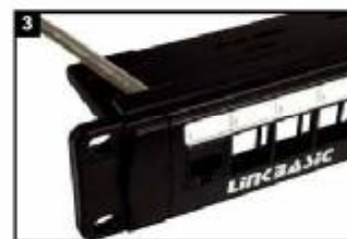
Insert the jack into the mounting location properly.